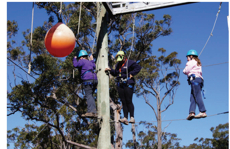
Aussie Bush Camp

All stallholders welcome $20 per site For bookings contact Christina Darlington 02 6547 4521