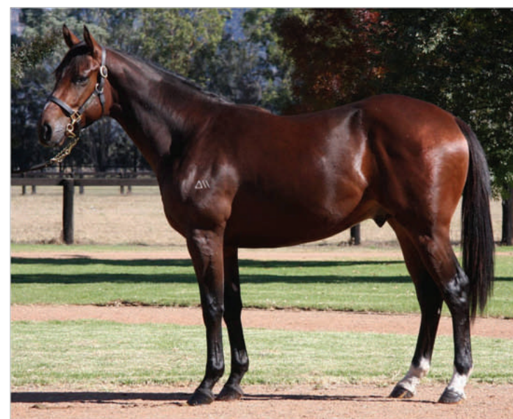
California Dane / Just a Snip colt

INGLIS SELECT SCONE YEARLING SALE This Sunday May 20 th will see our thoroughbred yearling colt by California Dane out of Just A Snip being auctioned at White Park, Scone. He is lot 96. The sale commences at 11.00am so come along and support this amazing venture that is a result of generosity from Kirksbridge Farm, Baerami Thoroughbreds, Widden Stud, Inglis and Sydney Horse Transport. All of our children will benefit from the sale of this horse.