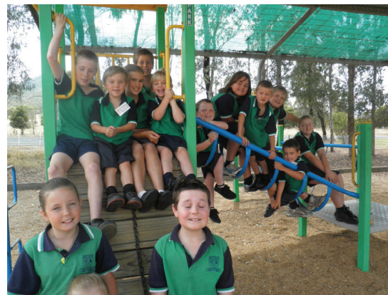
Our Kinder Orientation children with their buddies.

They also listen while Mrs Eveleigh explains the "Focus of the Week" each week. Today they participated in some role plays based on what we should do if we need to interrupt someone.