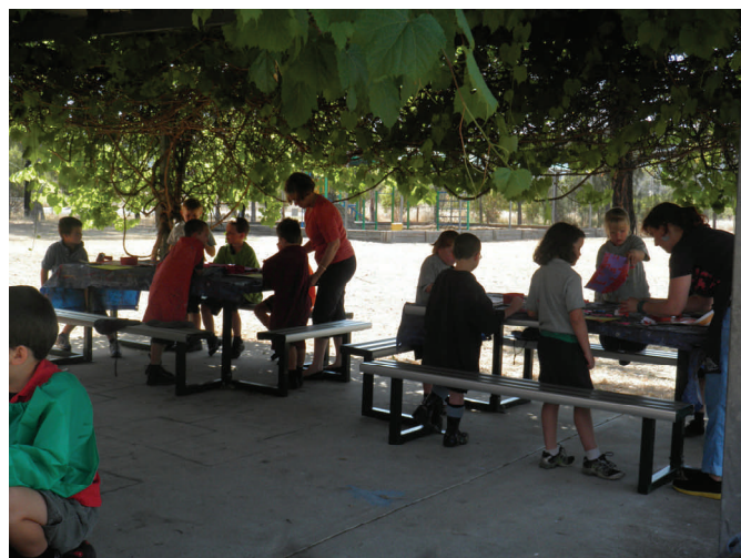
Raw Art workshops yesterday.