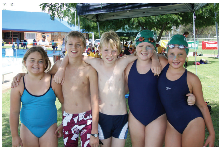
Sandy Hollow Swim Team

Due to the increasing cost of printing our usually very colourful newsletter each week, we are going to begin emailing it to those parents who have supplied us with an email address. It will go out in Adobe PDF format, and should be able to be opened in either that format or with "word". Parents will be advised the week before, when emailing will begin.