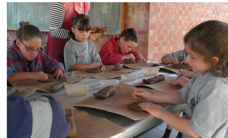
Raw Art workshop