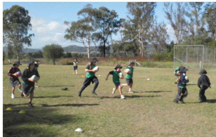
ARL Football clinic

Don't forget to get your envelopes in by Friday 11th May!