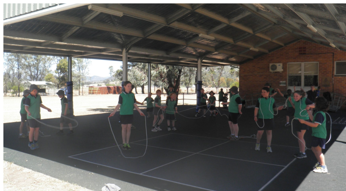
Jump Rope practice in full swing.