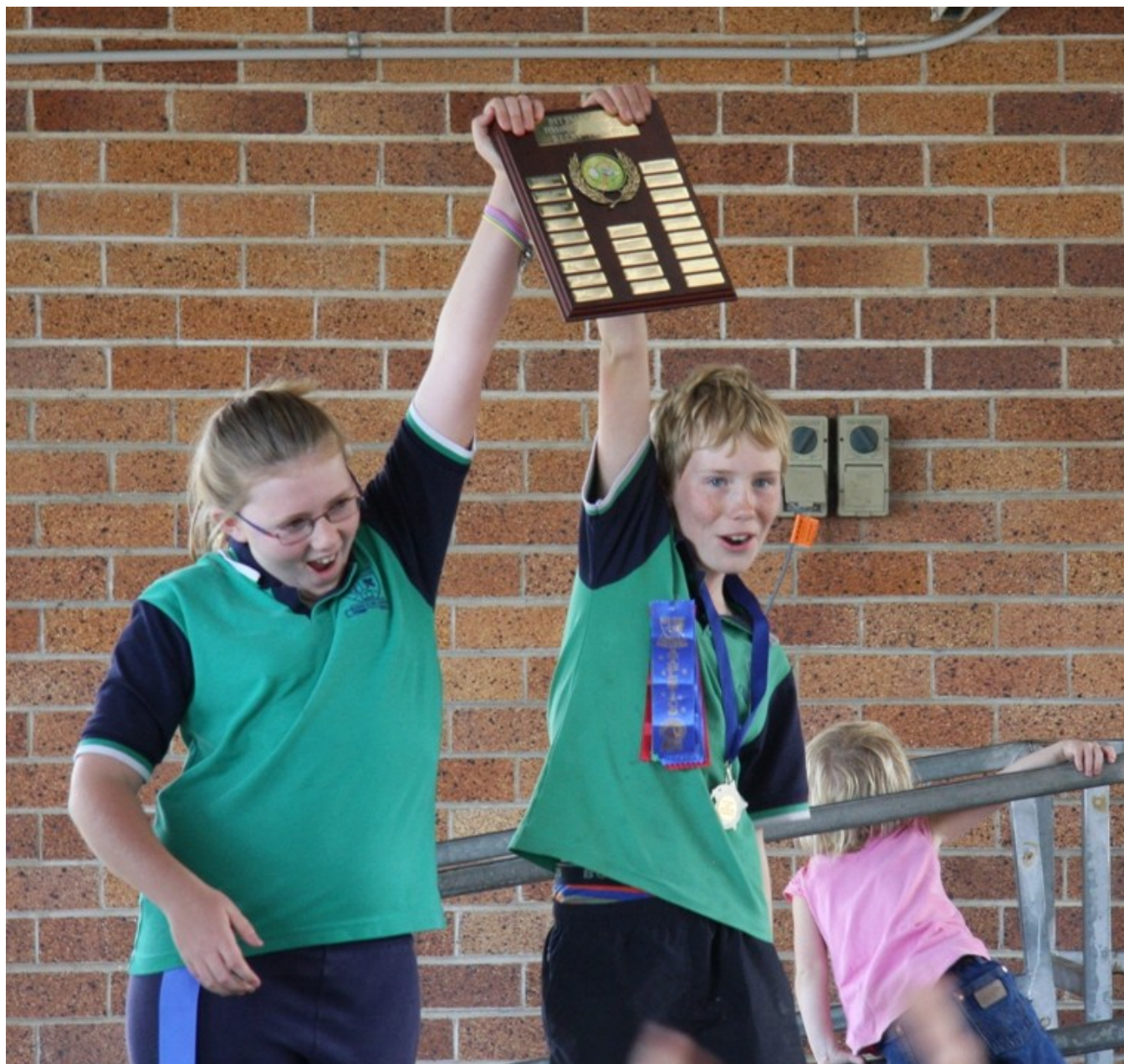
Our Sports Captains raise the trophy high!