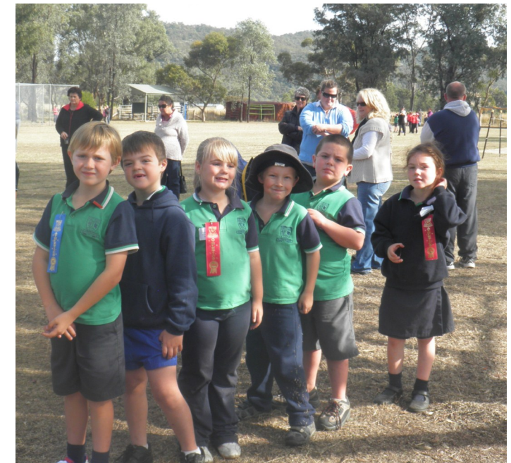
Pittman Cup Ball Games