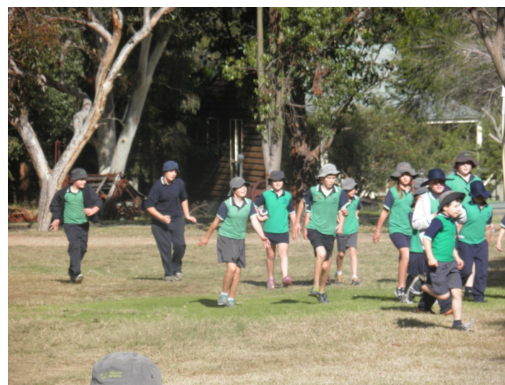
Last Fridays Walk-a-Thon at the Sandy Hollow Caravan Park. The students have raised over $1500 for their school.