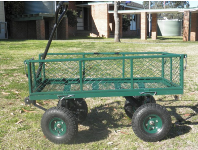
Trolley as part of Father's Day Raffle prizes.

We are looking for some more volunteers for breakfast club. Someone is needed either Mon, Tues or Wed. Takes about 1/2 an hour of your time. Please call at the office or see one of the teachers. Thank you.