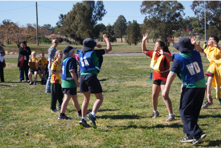
Netball Gala Day

We are looking for some more volunteers for breakfast club. Someone is needed either Mon, Tues or Wed. Takes about 1/2 an hour of your time. Please call at the office or see one of the teachers. Thank you.