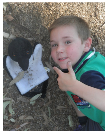
K/1 working on a maths investigation.