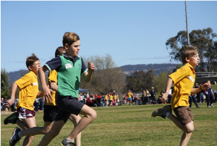
Zone photos - courtesy of Katie Thompson.