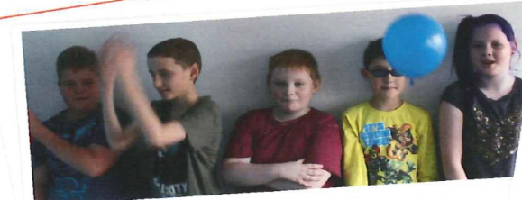
2015 Social Skills group having fun!