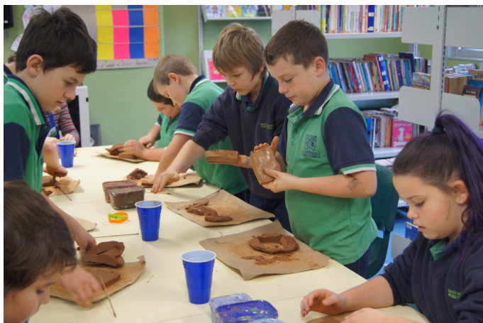
Last week's Raw Art activities.